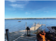
Yellow Farmhouse B&B (Georgia Plains) and passes to the Vermont Comedy Club