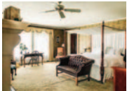
South Shire, a little Hotel (Bennington)