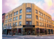
Latchis Hotel & Theatre (Brattleboro) and two movie passes