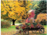
White Birch Lakeside Retreat (Newport) and a family entry to Jay Peak Pump House Indoor Waterpark