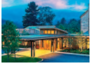
Topnotch Hotel (Stowe)

We have an incredible list of Vermont Experiences available in this year's raffle courtesy of wonderfully supportive Vermont businesses. All Inn stays are for two nights.