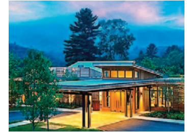
Topnotch Resort Abi Sessions, Weybridge, VT