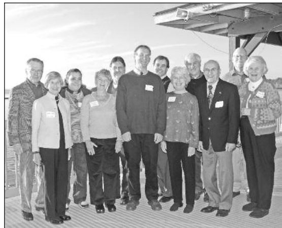
HomeShare Vermont Board of Directors

geographic focus, essentially making the choice to go deep instead of broad, and to concentrate our efforts at growing the number of