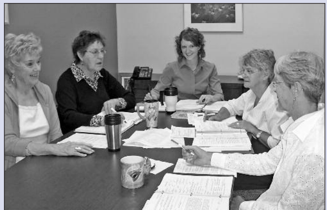
Weekly case conference meeting with volunteers.