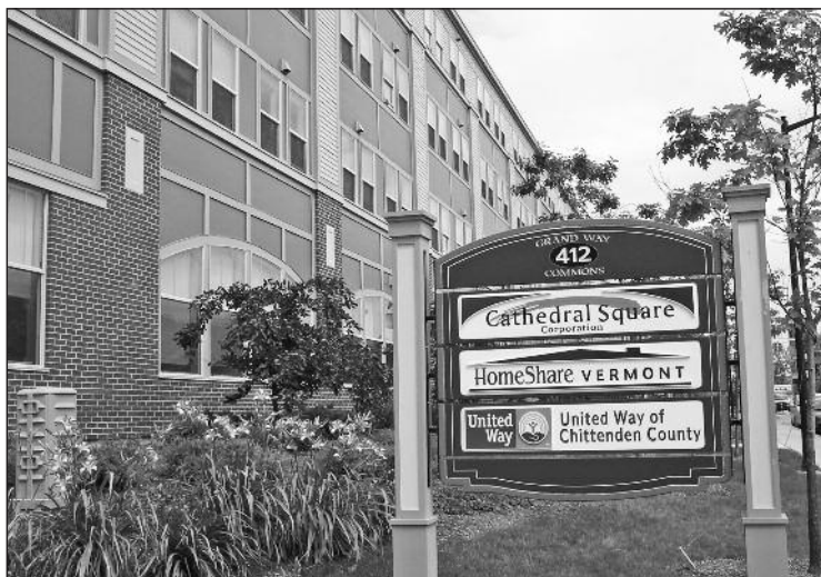
Our home in South Burlington.