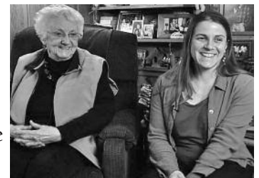
Stars of our video.

With a generous grant from the Wurster Family Foundation, HomeShare Vermont has a new promotional video thanks to CCTV Productions! The video is used during Interviews to give applicants a little more information about homesharing from people who are in a match. It is also used as an outreach tool when we go out and talk with groups such as senior meal sites, Rotary Clubs etc. The Video is only ten minutes long, so if you are a member of an organization whose members would like to hear more about homesharing, give us a call!