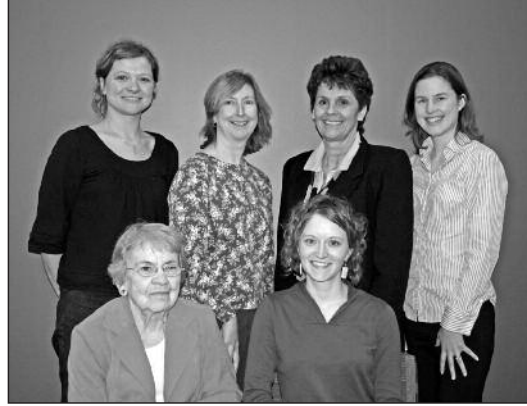
Staff and AmeriCorps members.

The nomination for this award came from our partner and funder, the Vermont Department of Disabilities, Aging and Independent Living.