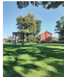
Snow Farm Inn, South Hero

As you enjoy these photos taken by a few of our 2023 Staycation/Vacation Raffle winners, start dreaming of where our next raffle might take you. We'll be launching the raffle in February and it promises to be even bigger than this past year's!