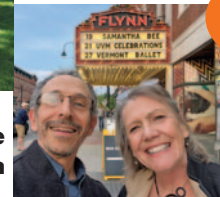
Samantha Bee at The Flynn